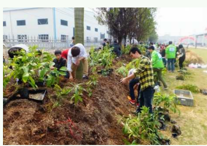
GSC Tree Planting in 2013