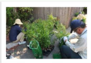
Bagging seedlings for shipment once they have grown to a big enough size