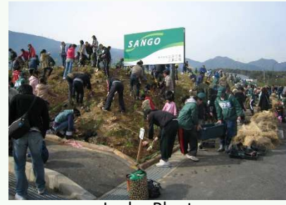
Inabe Plant Tree Planting in 2015