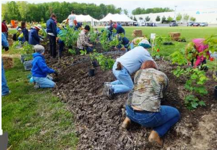
ASI Tree Planting in 2014

Although the soil, climate, and tree varieties differed in each area, they all resulted in healthy wooded areas. These woods have become homes to many living organisms, sequester large amounts of CO 2 , and bring soothing comfort to our members. When we see each company with big, strong trees and birds flocking to them, it underscores the feeling of contribution that tree planting can make to the promotion of biodiversity.